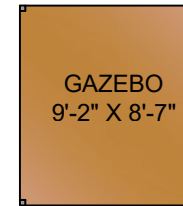
GAZEBO 9'-2" X 8'-7" LOCATION OF GAZEBO ON PLAN DOES NOT DEPICT ACTUAL LOCATION